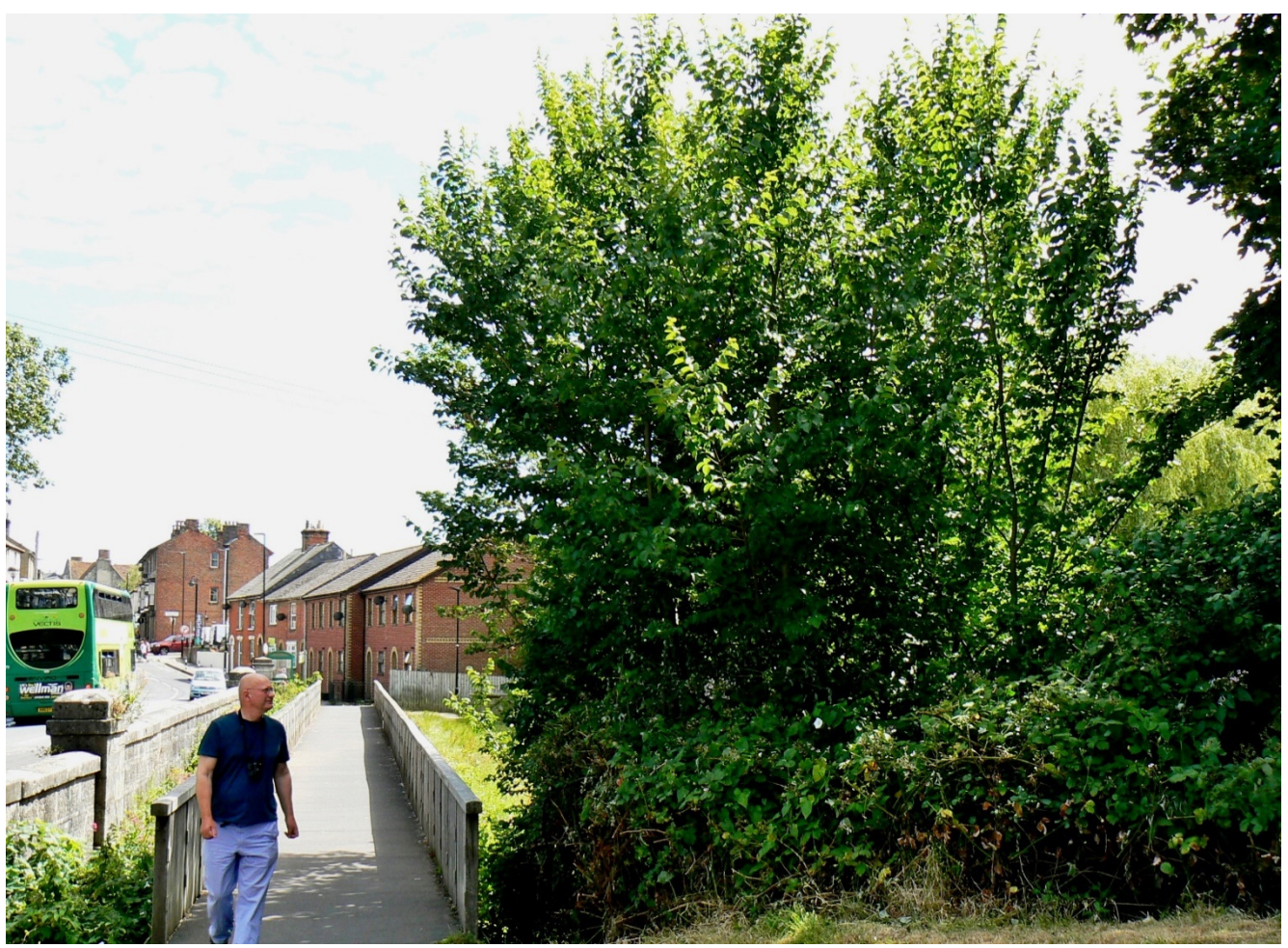
Figure 1. LUTECE elm, Newport, IoW, hosting the WLH in 2015