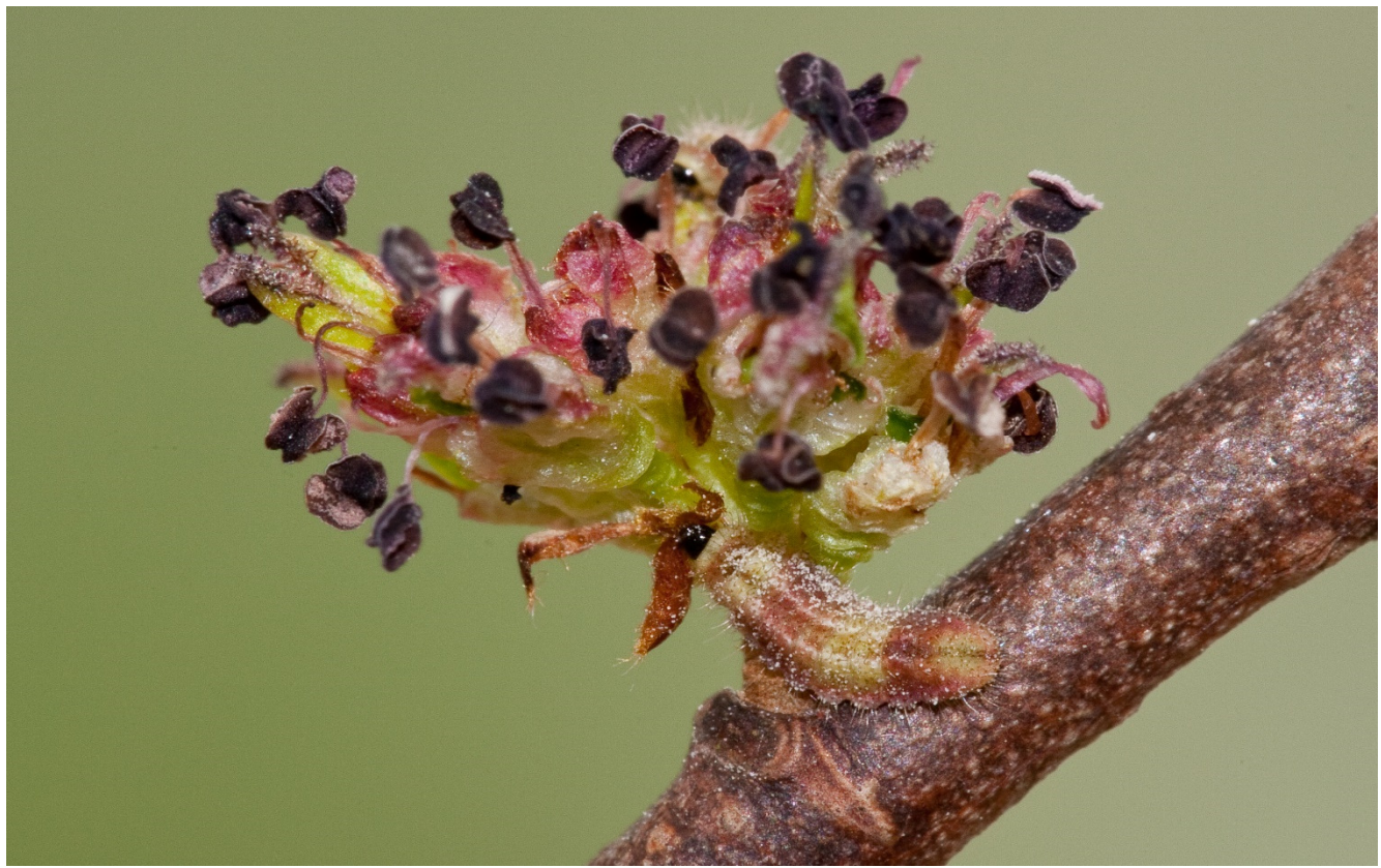
Figure 2. White-letter Hairstreak larva on elm flower.

NB. The French natural history unit VarWild has produced a 14 minute film of the lifecycle of the WLH, with close-up photography: https://www.youtube.com/watch?v=vdDNGF2HDr0