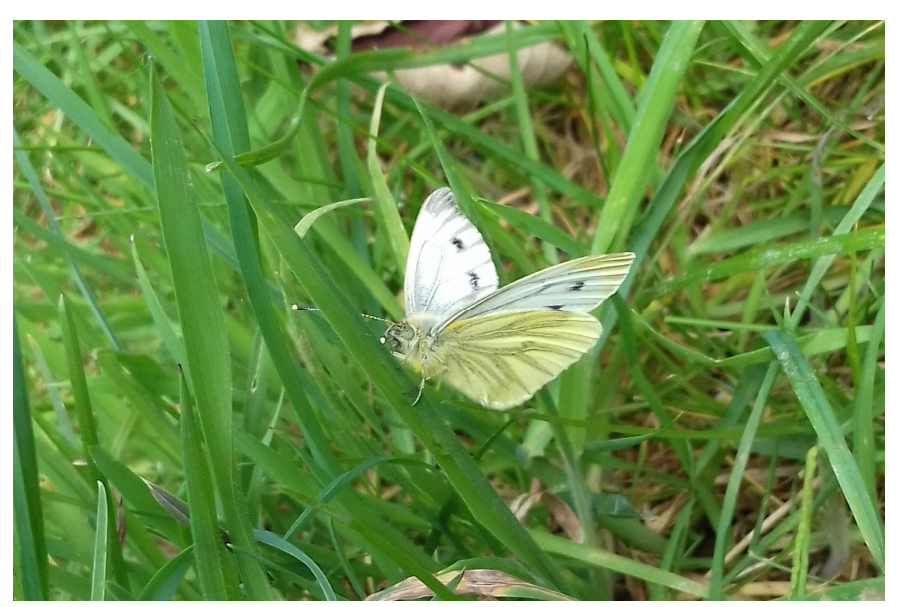
Green-veined White, Breamore – Ian LW