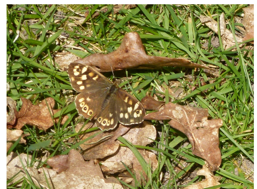
Speckled Wood, Blackwater – Linda B