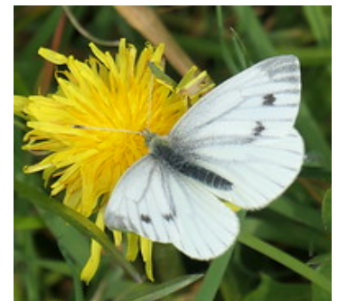
Green-veined White (Neil Smith)

Moths to spot: If you're very lucky you may catch sight of a female Muslin Moth . These tend to be on the wing in Hampshire during April and May and are seen in parts of the New Forest and along the Avon Valley. With a wingspan of about 40mm, the female is white, with slightly translucent wings. The males are duller grey in colour and only tend to fly at night. This is probably the last week the Orange Underwing is likely to be seen, although the best chance to see the Emperor Moth will be over the next three to four weeks.