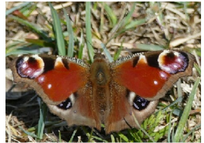
Peacock (Ron Taylor)

Twelve different species were seen this week, including Green-veined White and an early Clouded Yellow at Blashford. Full numbers were Brimstone (308), Peacock (142), Speckled Wood (137), Orange-tip (40), Comma (12), Small White (6), Red Admiral (6), Green-veined White (4), Large White (3), Holly Blue (2), Clouded Yellow (1) and Small Tortoiseshell (1).