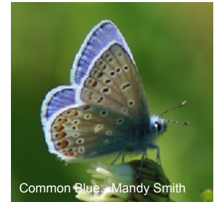
Common Blue - Mandy Smith

A total of 274 butterflies were reported from 28 routes equating to 4.04 butterflies/km. This is the lowest density for Week 7 since the group commenced back in 2010. However, perhaps we are approaching an early June 'Lull'?