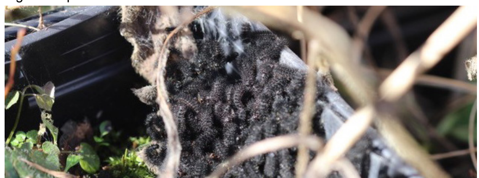
Exciting early emergence of our Marsh Fritillary larvae. Clive Wood

Our project to re-introduce the Marsh Fritillary to sites in north-east Hampshire usually follows the larvae into a form of hibernation over winter as nature's seasonal clock continues its course and progress slows. The Devil's-bit Scabious plants get an occasional drink and a late autumn prune. We keep an eye on the breeding cages and check for predators, winter hibernacula webs, holes in the meshing, loose doors and storm damage. Usually there is little activity to see and this winter there has been no need to send a report into Natural England. Instead, the breeders swop the occasional email and Andy Barker and myself catch up on overdue paperwork. We fret that the larvae will suffer if they emerge too early into a heavy frost or don't emerge at all. We re-assure ourselves that we have made good plans but worry that the plans are not good enough. I'm not going to compare myself with an expectant mother but drawing a parallel with a clucking hen is not entirely unjustified. The project has been 6 years and counting and it is proving to be quite a birth.