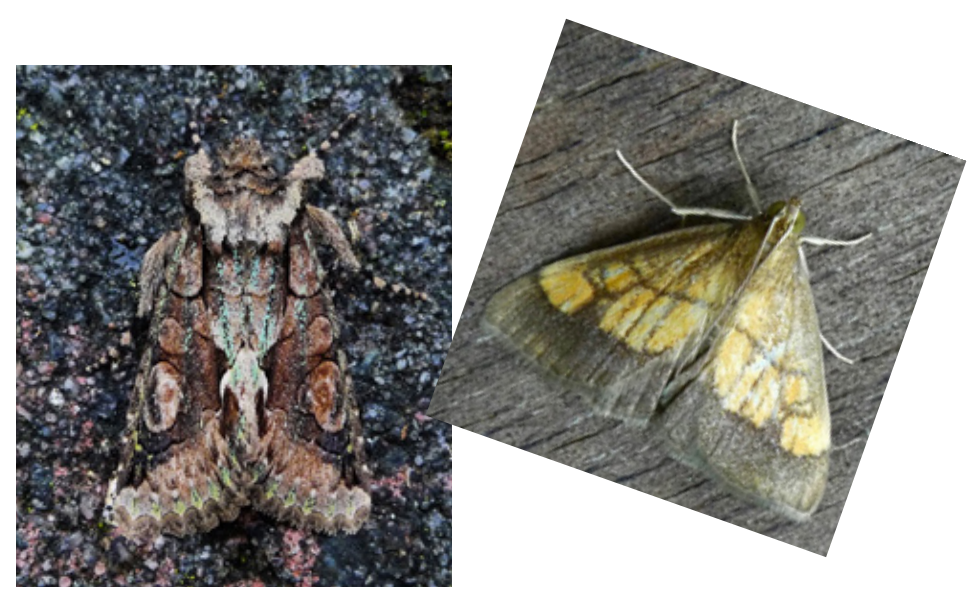
left Green-brindled Crescent (Allophyes oxyacanthae). right Evergestis limbata.

The final moth tally for the event was twenty-eight species. Thanks to an unseasonably warm evening with a low of 15°C this was an exceptional record. There were six new species observed in the garden taking the list here beyond 250 species. Moths such as Black Rustic, Straw Dot, Beaded Chestnut, Common Marbled Carpet, Brimstone, Green-brindled Crescent and Setaceous Hebrew Character were out in numbers. In addition to the Four-spotted Footman, a smaller micro moth, Evergestis limbata , was a nice surprise too so late in the year - a moth that was once regarded as Nationally Scarce but is now appearing more frequently as a result of a probable locally established population. All Lepidoptera records will be reported into Butterfly Conservation and retained for Hampshire biodiversity records. Unlike in the 18th century from what is read, all the insects were safely released back to suitable habitats.