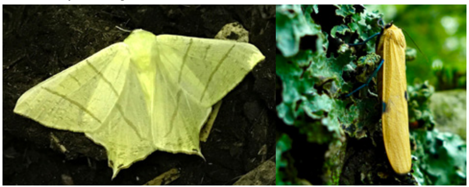
left Swallow-tailed Moth (Ourapteryx sambucaria). right Four-spotted Footman (Lithosia quadra).

Despite such early success this proved to be the last moth we found attracted to the sugar! For reasons which will remain a puzzle, the ivy in the grounds didn't appear to attract moths or other night-time insects despite attracting pollinators and feeders, such as Red Admiral butterflies, during the day, including on Saturday morning.