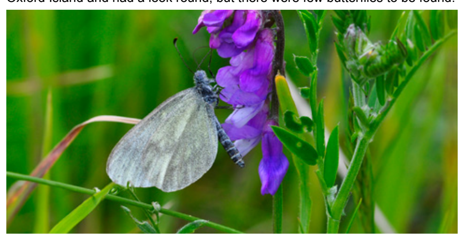
Cryptic Wood White (Leptidea juvernica). Dave Pearson

As the day progressed the weather improved with some long sunny intervals. although the wind had picked up significantly. I decided it might be best to try for the Cryptic Wood White during the afternoon as the forecast for the next day was not promising. I then headed over to Craigavon Lakes in County Armagh to an area suggested by Ian where he had seen around 50 individuals at the end of May. The temperature had now improved and, despite the brisk wind, conditions were suitable for butterflies. Keeping to the area south of the railway line which afforded some shelter, I soon found at least eight active Cryptic Wood Whites, probably males seeking females, only stopping to nectar very briefly. Their energetic activity was quite different to that of the Wood Whites I had seen previously in the UK. I was just thinking that I would find it hard to get any photographs when I found one nectaring on some Tufted Vetch (Vicia cracca) which allowed me to get close. Very few other butterflies were seen in that area, just one (Irish) Green-veined White (Pieris napi ssp. britannica) and a Ringlet (Aphantopus hyperantus). Afterwards, I drove over to Oxford Island and had a look round, but there were few butterflies to be found.