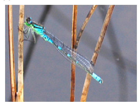
Irish Damselfly (Coenagrion lunulatum). Illustration Dan Powell.

The first day started with what you could typically be described as a 'soft day' being generally grey, cloudy, with occasional light rain and hardly any wind. I decided to concentrate on finding Irish Damselfly as conditions were not ideal for butterflies, and visited an area of the Montiaghs Moss NNR recommended by Ian. This involved negotiating some very boggy ground where I soon found six males holding territory around some water-filled peat workings. Due to the weather these individuals afforded some good, albeit distant, photographic opportunities as they were reluctant to move too far in the cool and overcast conditions.