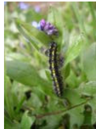
Scarlet Tiger larvae

Dan Hoare writes: "Scarlet Tiger larvae are out of hibernation and voraciously munching through Forget-me-not in my Winchester garden. They're more usually found on Comfrey and Nettles in the river valleys here."