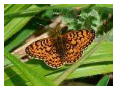
Small Pearl-bordered Fritillary

Alan Thornbury reports from Bentley Wood (Eastern Clearing) (SU260292) where the following observations were made: Small Pearl-bordered Fritillary (6 "All Males"), Duke of Burgundy (1), Grizzled Skipper (3), Dingy Skipper (1), Orange-tip (4), Brimstone (3). "The Small Pearl-bordered Fritillaries and Duke Of Burgundy were in the damper, eastern section of the clearing."