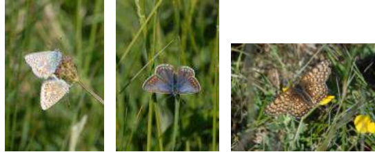
Common Blue Common Blue Glanville Fritillary

Mike Mackrill reports from Newton Nature Reserve (418908) where the following observations were made: Glanville Fritillary (3), Common Blue (25 "Numerous"), Grizzled Skipper (6).