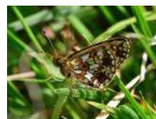
Small Pearl-bordered Fritillary

mark swann reports from testwood lakes (SU344155) where the following observations were made: White-letter Hairstreak (2 Larval "almost fully grown on wych elm and english elm"), Green Hairstreak (6 "2 females oviposting on birds foot trefoil"), Common Blue (37), Small Copper (2), Brown Argus (6), Green-veined White (3), Orange-tip (3), Dingy Skipper (1), Peacock (1), Red Admiral (2), Small Tortoiseshell (1), Comma (2). "brown argus and white letter hairstreak are breeding on the reserve. all english elm on the reserve is elm suckers which are currently thriving."