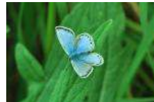
Common Blue - female ab. fusca-supracaerulea

Philippa Gordon reports from Magdalen Hill Down (SU506293) where the following observations were made: Brown Argus (4), Chalkhill Blue (1 "I am sure the attached photo is of a Chalkhill Blue as it was so much paler than the Common Blues but I realise this is very early so apologies if I'm wrong!"), Common Blue (30), Green Hairstreak (4), Large Skipper (10), Small Blue (20). "A rather blustery afternoon at MHD but the butterflies were still active and the sighting of a possible Chalkhill Blue was a definite highlight!". (The consensus of opinion on the UK Butterflies Forum ( http://www.ukbutterflies.co.uk/phpBB/viewtopic.php?f=14&t=5234 ) is that Philippa's butterfly is a female Common Blue aberration.) (Piers Vigus has kindly identified the aberration as fusca-supracaerulea )