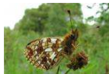
Small Pearl-bordered Fritillary

Bernard Dempsey reports from Bentley Wood (SU262294) where the following observations were made: Small Pearl-bordered Fritillary (16). "On entering the lower meadows at Bentley Wood on Thursday afternoon I found this impish looking SPBF waiting for the sunshine. I almost touched it with my wide angle lens and it didn't move! 16 Small Pearls all told flying with some faded and tatty Pearl Bordered, still many Brimstones and Speckled Yellow Moths. The Blue Bugle feeding this new generation of Small Pearls."