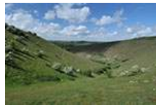
Ramsdean Down from Butser