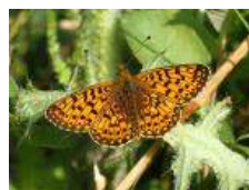
Small Pearl-bordered Fritillary

gary palmer reports from wootton coppice (SZ247996) where the following observations were made: Speckled Wood (4), Pearl-bordered Fritillary (2 "female worn"), Small Pearl-bordered Fritillary (7 "all fresh, 1 female"), Green Hairstreak (1), Common Blue (3 "male"), Brimstone (3 "female"). "a short walk in the forest found the above".