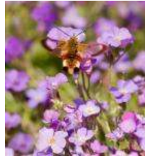
Broad-bordered Bee Hawkmoth

Chris Button reports from West Wellow (SU290190) where the following observations were made: Broad-bordered Bee Hawkmoth (1). "An individual which, over the last 10 days or so and for a few minutes each day, has been coming to Aubretia in my Dad's garden in West Wellow."