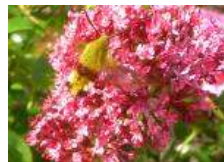
Broad-bordered Bee Hawkmoth

gary palmer reports from barton on sea (SZ24389327) where the following observations were made: broad bordered bee hawk (1). "in a garden in barton on sea feeding on red valerian".