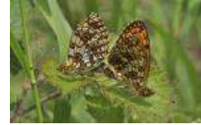
Small Pearl-bordered Fritillary

Mark Tutton reports from Brighstone Down (SZ423843) where the following observations were made: Glanville Fritillary (10), Dingy Skipper (30), Brown Argus (4), Common Blue (6), Cream Spot Tiger (1). "Sarah and I had a couple of lovely days on the isle of wight and spent the first day at Compton Bay where despite the wind we came across plenty of Glanvilles and Adonis Blues as well as two fresh Large Skippers - our first of the year. Today we discovered two small disused chalk pits on Brighstone Down which were teeming with butterflies including numbers of Glanvilles some way from the coast. We retired to the Pointer Inn at Newchurch for lunch [highly recommended] when I nearly squashed a beautiful Cream Spot Tiger on the doormat!!! After a couple of quick pictures - much to the amusement of the locals we released it in a much safer location. A very enjoyable trip".