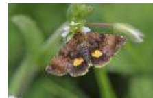
Small Yellow Underwing

Stuart Read reports from Parkhurst Forest (SZ474911) where the following observations were made: Brimstone (15 "13m 2f"), Small Heath (12), Grizzled Skipper (2), Red Admiral (6), Wall (2), Holly Blue (1), Speckled Wood (1), Peacock (1). "Sadly, no sightings of any Pearl-bordered Fritillaries yet this Spring. The species has been surviving in very small numbers for some years. Much work has been carried by Forest Enterprise with a view to improving habitat for butterfly populations, but there is no evidence that the PBF has responded. It would be a tragedy if this butterfly is lost in Parkhurst and the Isle of Wight."