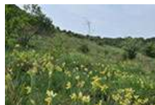
Beacon Hill NNR

Bob Whitmarsh (RWh) reports from Broughton Down (SU291289) where the following observations were made: Grizzled Skipper (2), Orange-tip (2), Holly Blue (7), Brown Argus (4), Dingy Skipper (3), Common Blue (4), Large White (1), Green-veined White (3), Speckled Wood (1).