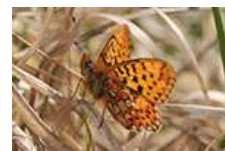
Female PBF at rest

Stuart Read reports from Parkhurst Forest (SZ473909) where the following observations were made: Small Heath (20), Brimstone (15 "10m 5f"), Speckled Wood (11), Common Blue (9), Grizzled Skipper (5 "enjoying a resurgence in the forest!"), Red Admiral (5), Comma (2), Wall (1), Peacock (1), Large White (1), Dingy Skipper (1 "not seen in the forest before"), Pearl-bordered Fritillary (0 "no sightings this Spring, sadly").