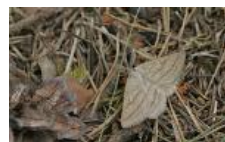
Common Heath Grass Wave