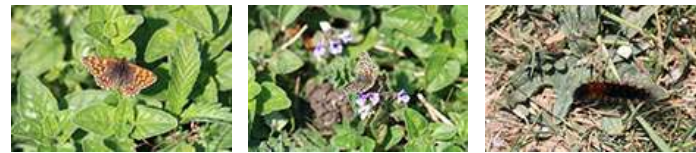
Duke of Burgundy

dave joan harrop reports from butser hill (su714210) where the following observations were made: Duke of Burgundy (14), Green Hairstreak (2), Small Copper (15), Dingy Skipper (6), Grizzled Skipper (10). "should have sent in but got distracted, a good walk from car park over ramsdean down, then down in to rakes bottom and back to car park".