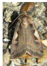
Setaceous Hebrew Character

Mark Tutton reports from Fort Purbrook (SU677063) where the following observations were made: Common Blue (7), Red Admiral (1), Small Blue (1). "I have seen very small numbers of small blue at this site - possibly three individuals all males - most restricted to a stretch of no more than 50m and at present. I have not seen any Kidney Vetch at all. It will be interesting to see what materializes - they may need some help if they are to flourish."