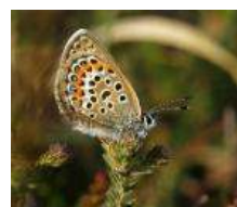
Silver-studded Blue Silver-studded Blue Silver-studded Blue

Chris Hall reports from Eelmoor (SU8453) where the following observations were made: Dingy Skipper (5), Grizzled Skipper (4), Brimstone (4), Green Hairstreak (22 "It has been a very good season for green hairstreaks at Eelmoor"), Small Copper (2), Common Blue (56), Brown Argus (6), Speckled Wood (9), Small Heath (25), Glanville Fritillary (2). "The Glanville Fritillary has now been present for at least six days. There were three on 19th, two today observed for about ten minutes around midday visiting flowers. One was still at the same spot at 4pm. NB. Eelmoor is a private site with no public access."