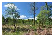
Typical Inclosure in the New Forest