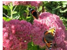
Small Tortoiseshell and Red Admiral

Peter Vaughan writes: "At last some decent weather! The find of the day was a single Small Tortoiseshell butterfly on the wing at Bartley Heath. That is only one I've seen anywhere in Hampshire this season. My other sightings at Bartley Heath today were 2 Small White, 3 Peacock, 1 Comma and 4 Speckled Wood butterflies, 1 Silver Y moth and 2 Fox Moth caterpillars. It was an excellent morning for Common Lizard sightings as well - numerous of this year's hatchlings were basking on tree stumps. I also saw a Dor Beetle on the wing - a striking sight with its large black body and purple wings. It settled, affording a few seconds view on the ground before it disappeared under a pile of fresh horse dung. Each to their own niche..."