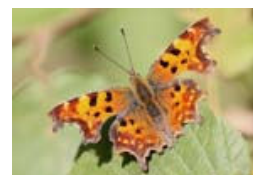
Comma f hutchinsoni

Andrew Bolton reports from Ashford Hill Meadows NNR (SU 563622) (38): Small Copper 43 (forty three). "A population explosion for the 3rd brood at this site! Numbers now three times what they were on the 6th September. Courtship, mating and aerial battles in full progress in the very warm late afternoon sun. Credit to the weather gods for a great September."