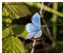
Adonis Blue - male