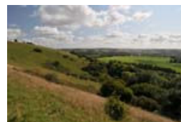
Old Winchester Hill from Beacon Hill