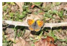
Small Copper ab. caeruleopunctata