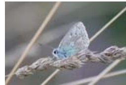
Chalkhill Blue ab.krodeli Gillmer