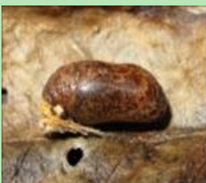
Figure 6: A reared Brown Hairstreak pupa. Note the dull colouration, a form of camouflage. (© Vince Massimo, UK Butterflies, 2011).

Once again, predation levels are high. The pupae are highly attractive to mice and shrews and up to 80% can be predated by small mammals (Thomas & Lewington, 2010).