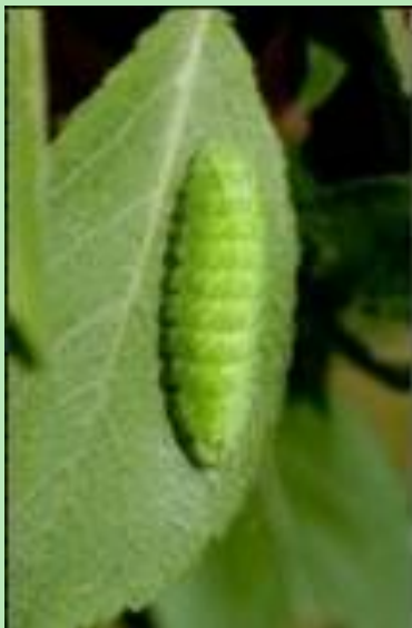
Figure 5: A Brown Hairstreak caterpillar attached to the underside of a P. spinosa leaf. (© Peter Eeles, 2006). Hosting the caterpillar appears to confer no benefit on the plant nor is there evidence that adults help to pollinate P. spinosa . The relationship between the species appears therefore to be a simple predator-prey one.

The eight-month hibernation reduces the food demands of the developing larva and is thought by de Vries et al. , (2010) to be the result of selective pressure working against prolonged presence as a caterpillar. Once emerged, the larva immediately adopts a number of predator-avoidance strategies. It is monophagous (i.e. it eats only one kind of food) and its first action is to crawl into and commence feeding on an unfurling blackthorn leafbud. After a fortnight the caterpillar moults and spends two further instars hanging upside down from a silk pad spun on the under-surface of a leaf. The caterpillars are extremely well camouflaged and only emerge at dusk to browse on the tips of blackthorn leaves (Newland et al. , 2010 and Thomas and Lewington, 2010).