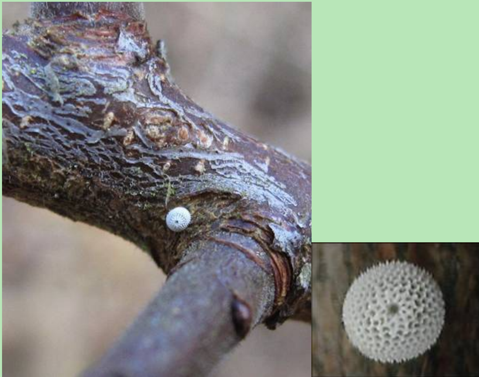
Figures 3 and 4: A Brown Hairstreak egg at the base of a blackthorn spine, left, and close-up, right,.

Ova are laid at low densities over wide areas of countryside almost always on the bark of Blackthorn ( Prunus spinosa ) at the base of a spine or where one-year-old wood branches from two-year-old stem (Thomas & Lewington, 2010). Fresh growth is always favoured over old, verdigris-covered growth. Most ova are laid singly (87.8%) in a fork (82.0%) (Merckx & Berwaerts, 2010).