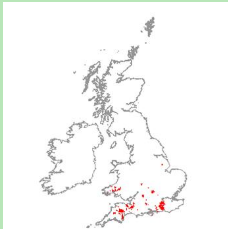
Figure 2a: The distribution of the Brown Hairstreak in Britain and Ireland between 2000 and 2010. (Source: National Biodiversity Network Gateway, 2km squares, using Butterfly Conservation and Biological Records Centre datasets). Isolated colonies can be found in Dorset, Hampshire, Wiltshire, Gloucestershire, Worcestershire, Oxford and Lincolnshire in addition to its three strongholds in the West Weald, Devon and Somerset, and west Wales. (Source: Thomas & Lewington, 2010).

The butterfly is widely distributed across central Europe from northern Spain to southern Sweden, and east through Asia to Korea. Within Britain it is locally distributed in the heavily wooded clays of the West Weald in Sussex and Surrey; in sheltered valleys in north Devon and south-west Somerset, and in south-west Wales. Within Hampshire, the species is found in low numbers on the clay soils around Noar Hill and Selborne Common in the east of the county and on the drier chalk and clay soils around Shipton Bellinger in the north-west, close to the Wiltshire border.