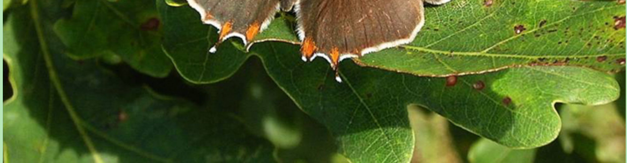
Figure 1: A female Brown Hairstreak ( T. betulae ). Males are slightly smaller and lack the bright golden orange band across the forewing.

The Brown Hairstreak was once a relatively common sight amongst hedgerows and deciduous woodland edges in late summer across southern England. However, long-term declines in traditional woodland practices such as layering and coppicing and the great loss of hedgerows that began in Britain after 1945 has led to a severe decline in the distribution and abundance of this member of the Lycaenidae family. The long-term population trend is classed as stable under the UK Butterfly Monitoring Scheme with an increase of 58% since 1983. However, abundance has decreased by 22.9% between 1990 and 2010 and by 53.1% between 2000 and 2010 (Botham et al. , 2011). The distribution of the species has also declined by 43% from 1970-82 to 1995-2004 (Fox et al. , 2006). These trends have led to the Brown Hairstreak being classified as a UK Biodiversity Action Plan Priority Species. It is listed as Vulnerable on the new Butterfly Red List and is prohibited from sale under Section 9, Part 5 of the Wildlife and Countryside Act 1981 (JNCC, 2010).