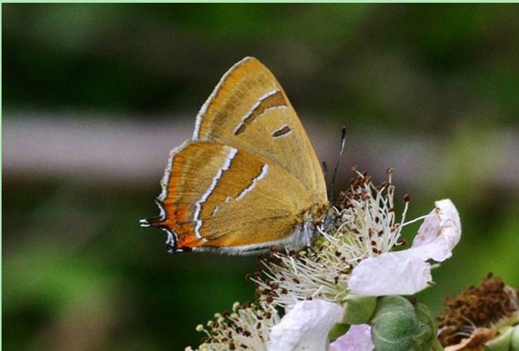
Figure 7: A male Brown Hairstreak. Note the white hairs on the body.

Thermoregulation plays an important role in the ecology of the species. This is done by micro-habitat site selection and by basking with wings held wide open 180° to the sun in weak sunshine. The tops of the wings are dusky and heat-absorbing. In hot weather, the upper-wings are held tightly closed. This exposes the shiny under-wings and white body hairs that reflect rather than absorb heat.