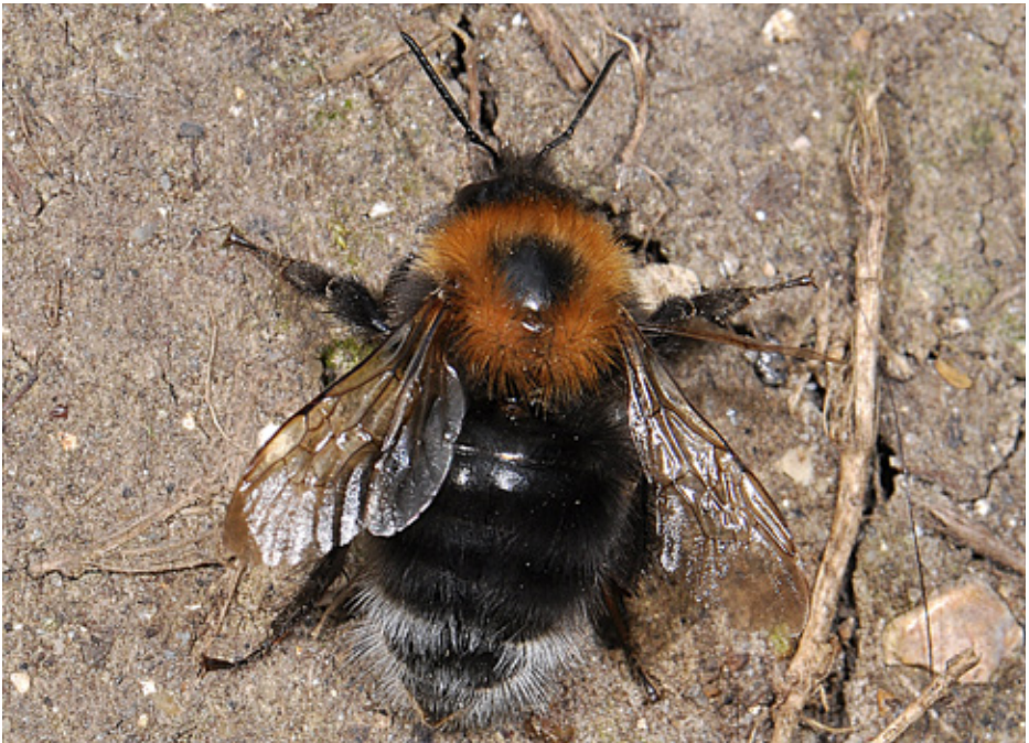
Tree Bumblebee. Paul Brock

Birds are not the only creatures attracted to nest boxes: spiders, woodlice, beetles and all manner of other creepy crawlies take refuge there, often making it their winter home. The mossy or grassy remains of nests offer additional insulation and protection from the weather. And it is not only birds that make their nests inside a handy box: bumblebees, especially the Tree Bumblebee, Bombus hypnorum , (below) are well known nest box colonisers. This bumblebee is a relatively recent arrival, which was first recorded in 2001 in Wiltshire. It has since become quite widespread and is common at Exbury.