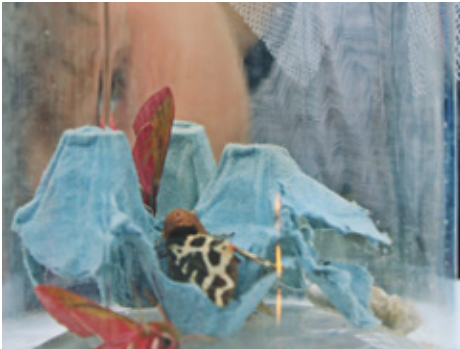
Moths from one of Arc's moth nights in July 2015