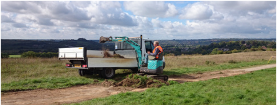
Path repairs at MHD. Jayne Chapman

This spring we will finally complete the repair works to the disabled access path. This runs the entire length of the reserve and, at 1,355 metres or 0.8 of a mile, it required some considerable work to scrape the vegetation back a metre either side of the path to reclaim it from the encroaching grassland.