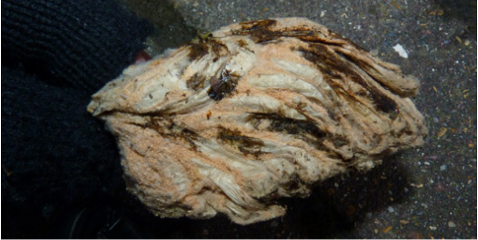
Nest of Bee Moth. Juliet Bloss

After a bit of investigation I discovered that the nest boxes had indeed been taken over by tree bumblebees, which in turn had been predated by Bee Moths, Aphomia sociella , (below). This is a small olive-grey moth, with a pinkish area on its forewings, sometimes confused with Wax Moths, a serious pest of beehives. Bee Moths lay their eggs in a web and feed on nest material and other detritus. When the larvae have developed fully they feed on the wax cells where the bumblebee's own larvae are developing, but do not usually destroy the entire brood. There is not much that can be done to deter them, but I hope that clearing them out and disposing of their nests will reduce the population somewhat, and allow the bees to breed successfully. One possible benefit might be to provide a winter larder for the Blue Tits. A pair was scolding angrily as we cleaned out the boxes.