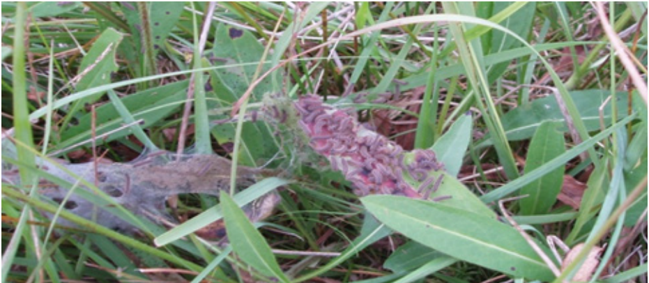
Marsh Fritillary larvae feeding on Devil's-bit Scabious. Clive Wood

Since our last Newsletter we have shared our plans with Natural England and I am delighted to report that we have been issued with the necessary licences to capture c.300 Marsh Fritillary larvae from colonies across east Dartmoor this autumn. The larvae will be brought to Hampshire and distributed between three breeders to begin a 2½-year captive breeding programme. In the meantime, 3000 Devil's-bit Scabious plants are happily growing in insecticide-free conditions with a small family-owned business in Devon. These plants will provide the food for our hungry caterpillars.