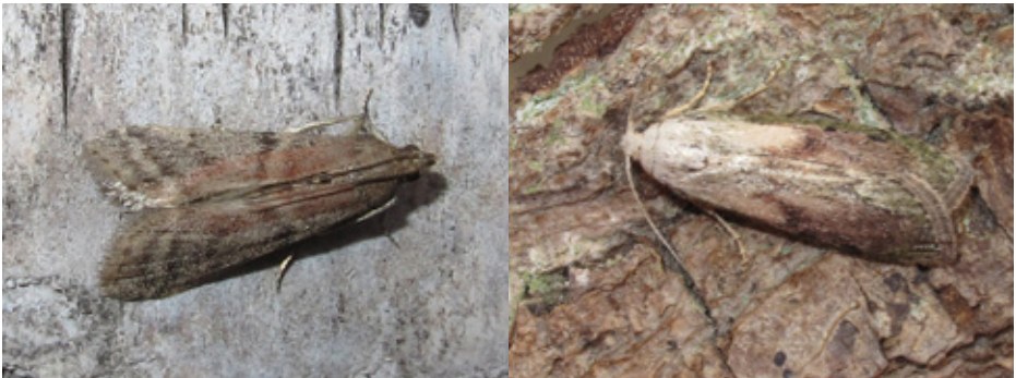
Bee Moths.