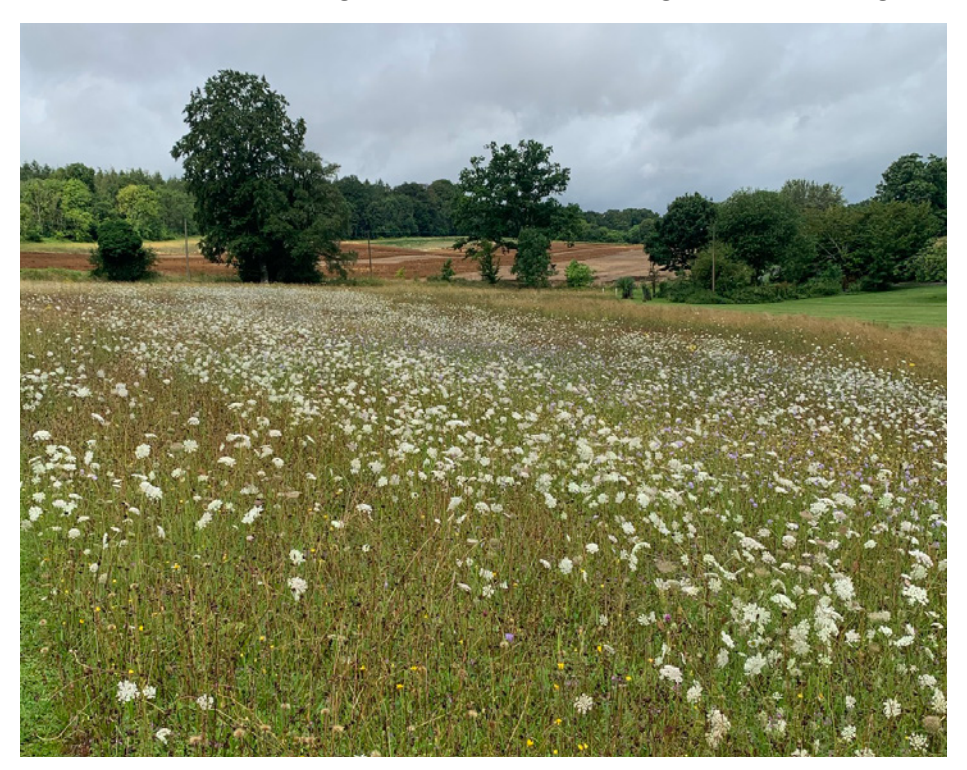
Looking splendid, the neighbourhood meadow. Steve Wheatley