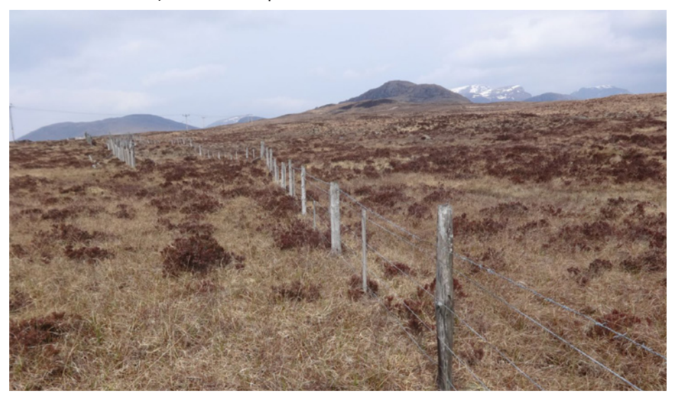
Typical habitat of the Rannoch Brindled Beauty.

It was two years before the situation changed, in late March 2012 we received a message that some of these very rare moths had been found near Garve and did we want to see them! Well yes, indeed we did, so a few days later at 6am (the early start was possibly so the cows on the croft got their breakfast on time) we set off up the hillside to the site.