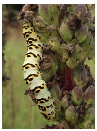
Striped Lychnis larva on Dark Mullein.