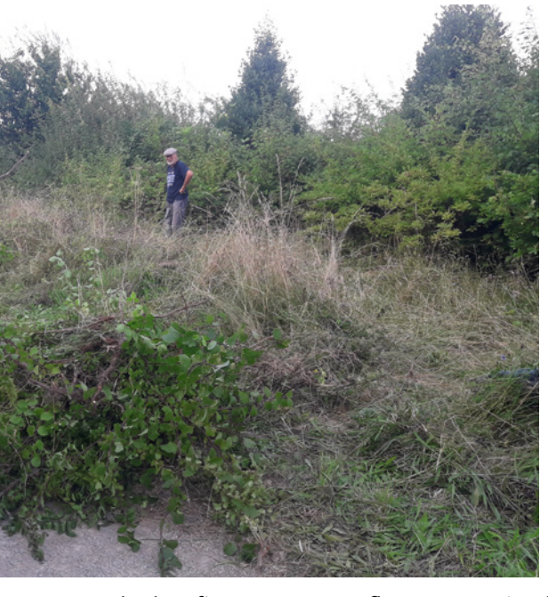
British White cows grazing at Magdalen Hill Down. Work party at Magdalen Hill Down. Fiona Scully

We have made progress in almost all of our 23 highest priority landscapes in the South East (12 of which are at least partly in Hampshire and the Isle of Wight). Together we have engaged extensively with land-managers in at least 16 of these landscapes. We have also engaged directly with land managers of at least 15 of the 35 highest priority sites outside our priority landscapes.