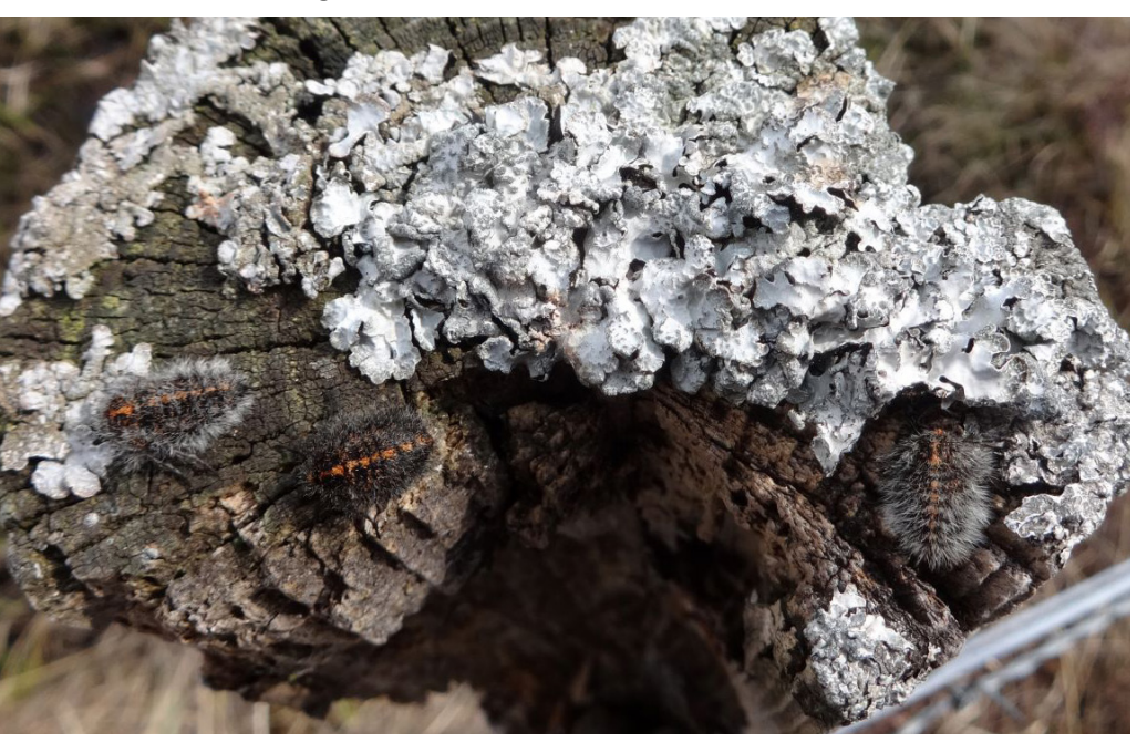
Three Rannoch Brindled Beauty, females.

Driving on through Oykel Bridge and spotting a likely looking fence we started another search, the temperature that day, 10th April, was 5 degrees but felt much colder in the wind. The fence we searched was a fairly new forestry fence and all we found was 1 male and 1 female. Disappointing, but at least the moths were still to be found in the area. On this occasion both insects were very close to the base of the posts, almost in the vegetation sheltering from the freezing wind.