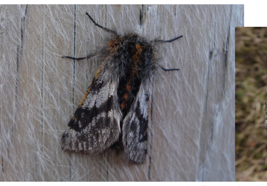
Rannoch Brindled Beauty, male.

The females being flightless look rather different, furry little bundles with dark bodies and a red stripe, they must have lost the ability to fly a very long time ago, only a very few showing scant remains of wings.