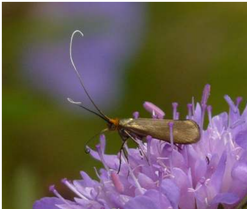
Nemophora metallica © Glynne Evans