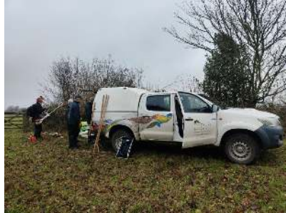
MHD cows at Pathfield (top) SDNP Volunteers (bottom)