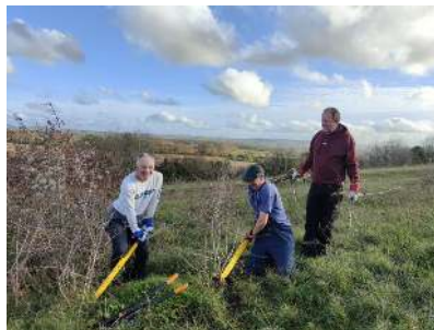
Tree 'popping' at YH