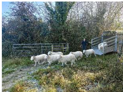
Sheep arrive at YH