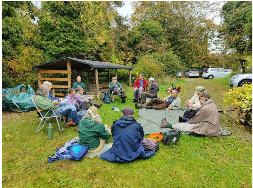
Volunteers at MHD taking a break