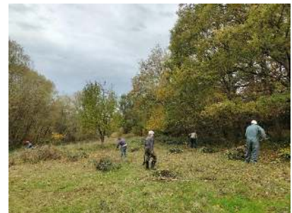
Cutting & raking at BSM

Wishing you all a restful, sparkly festive season,